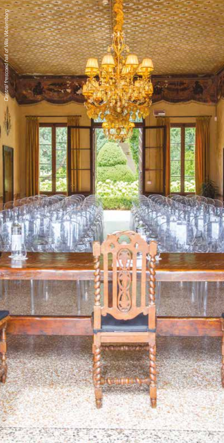
Central frescoed hall of Villa Wollseburg