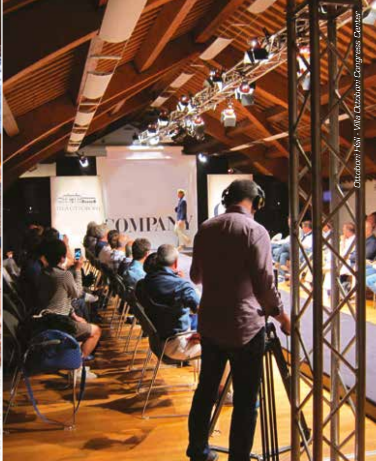
Ottoboni Hall - Villa Ottoboni Congress Center