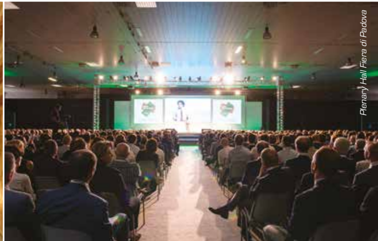
Plenary Hall Fiera di Padova