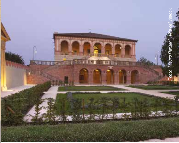
Villa dei Vescavi