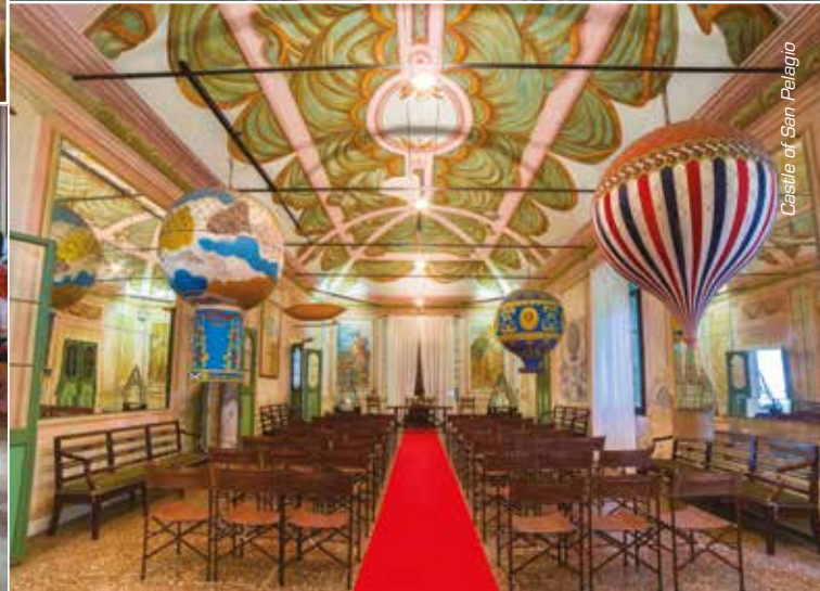
Castle of San Palagio