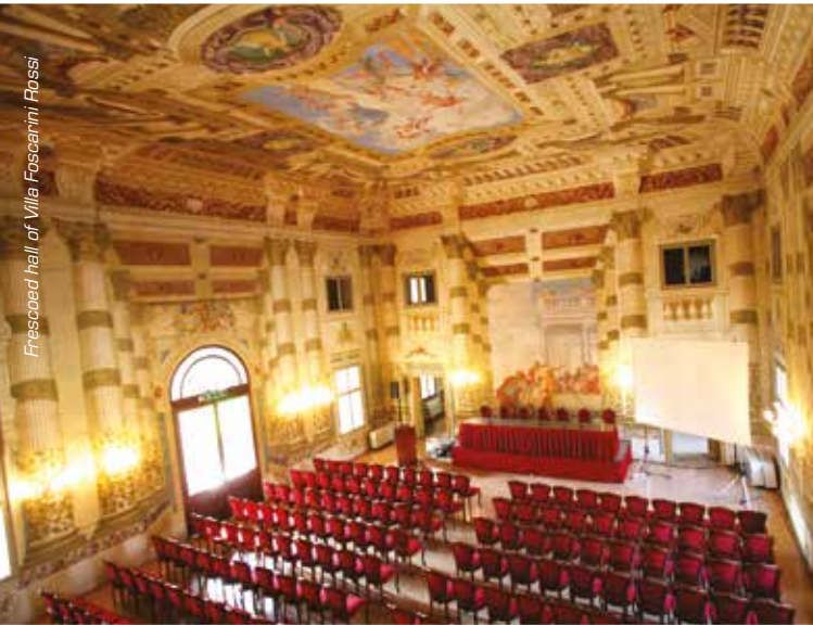
Frescoed hall of Villa Foscari, Rossi

From charming locations surrounded by nature with particular attention to sustainability, to modern and high-tech congress centres, Padua is the right place to find a solution for all your needs. For a event, the choice varies from elegant villas and castles, multifunctional buildings such as cultural centres, ateliers, industrial technology centres or “moving locations” such as the boats sailing around the city through the rivers following the town walls. The city of Padua hosts congressional hotels of any type: business international chains, boutique hotels in the historical centre, hotels with a long family heritage located in the thermal area with a modern wellness vocation.